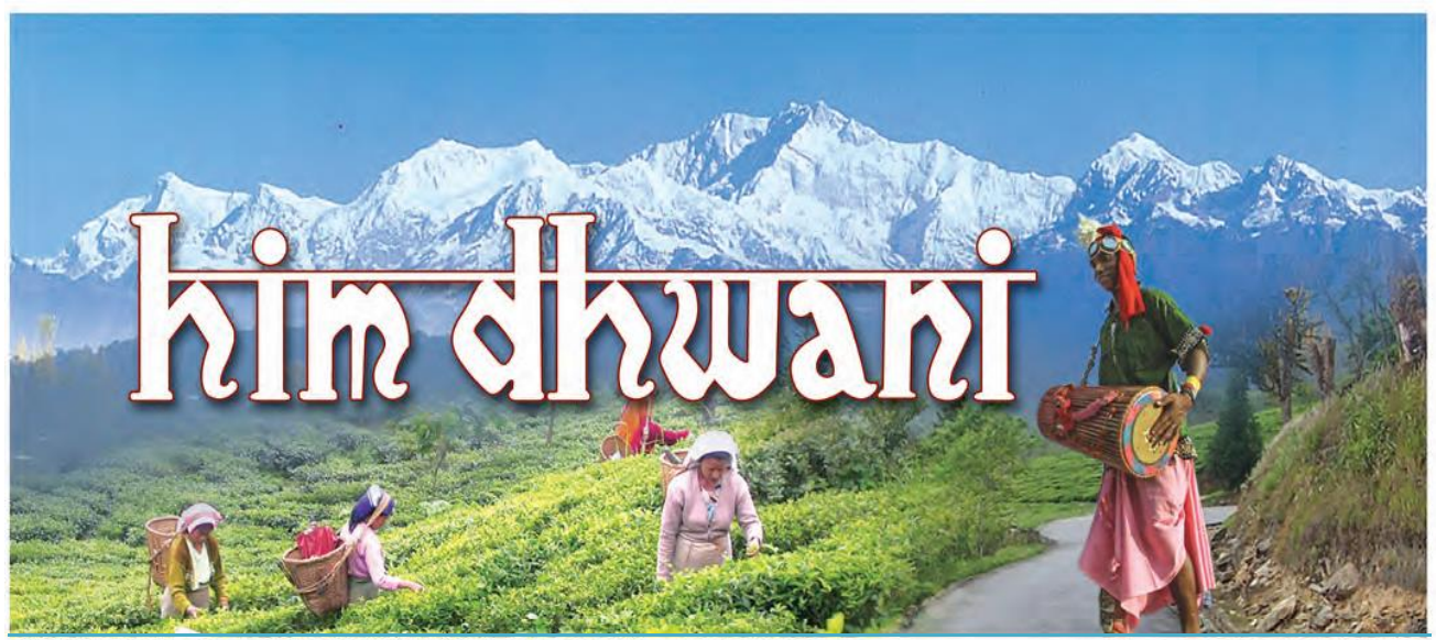
Prabhu Jisu Residence, Post Box 3, Matigara – 734 010, Dt Darjeeling, West Bengal