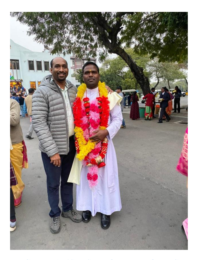
FR GENERAL'S VISIT TO THE PROVINCE